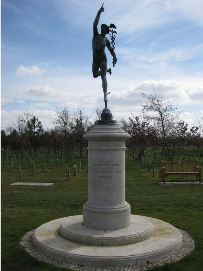
6 Royal Corps of Signals