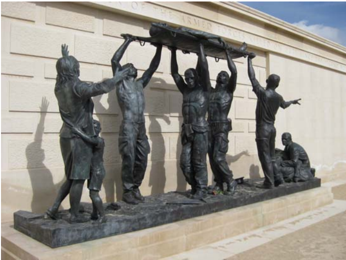
13 Special Forces Memorials