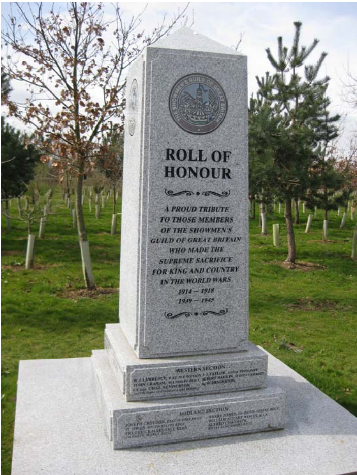
7 Showmen's Guild