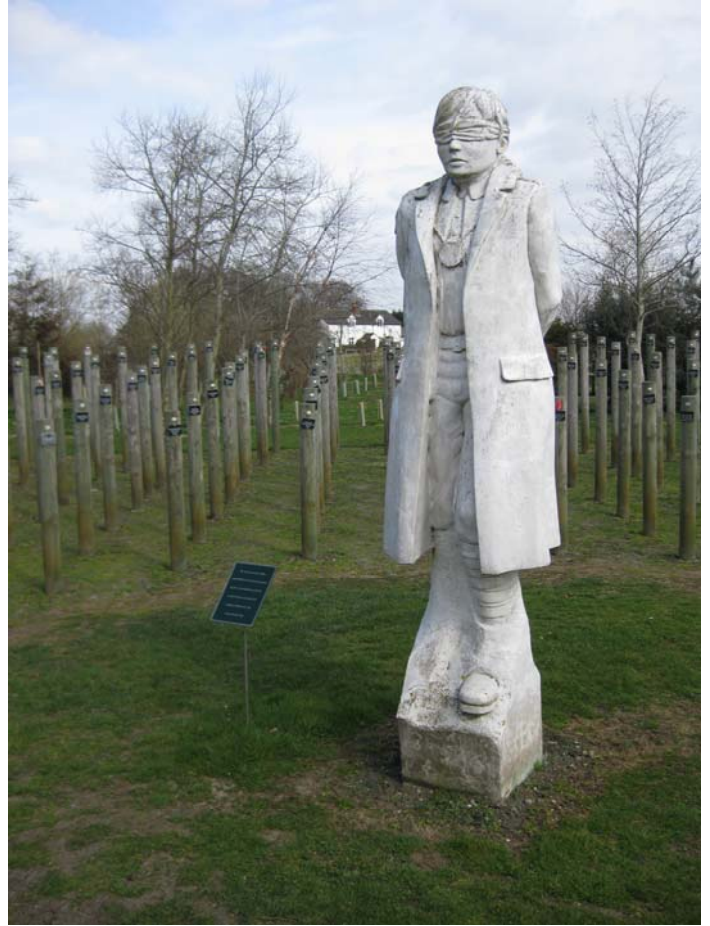
8 Shot at Dawn