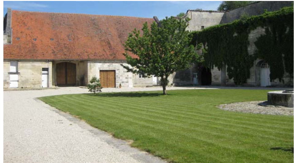
Carriere l'Eveque Courtyard: May 2014