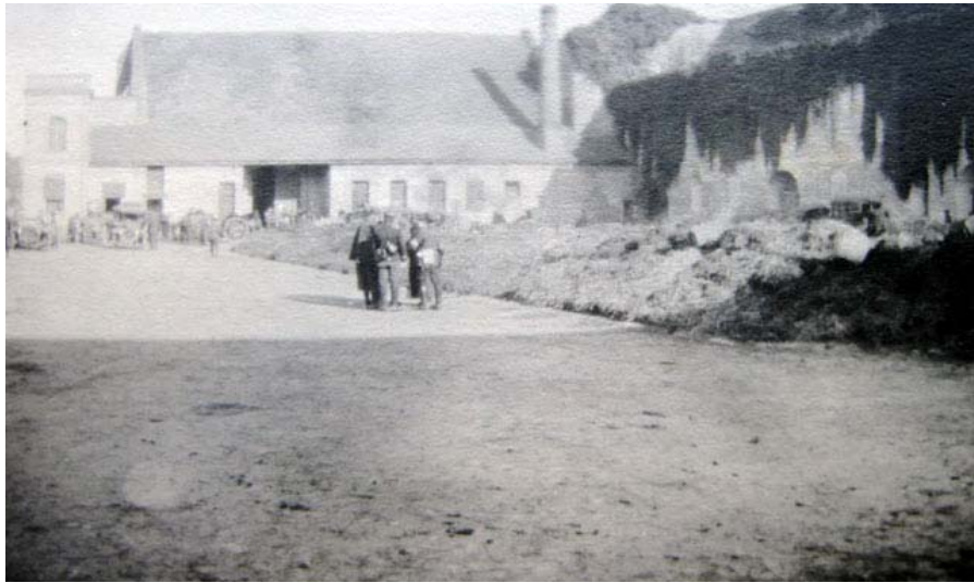
Carriere l'Eveque Courtyard: Oct 1914