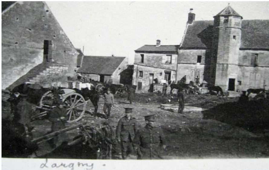
Largny Farm Courtyard: Oct 1914