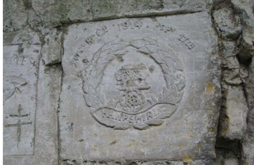
Enlargement of Hampshire Crest