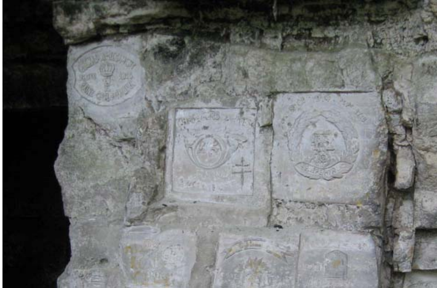
German, French & English Carving at "Hampshire" Cave