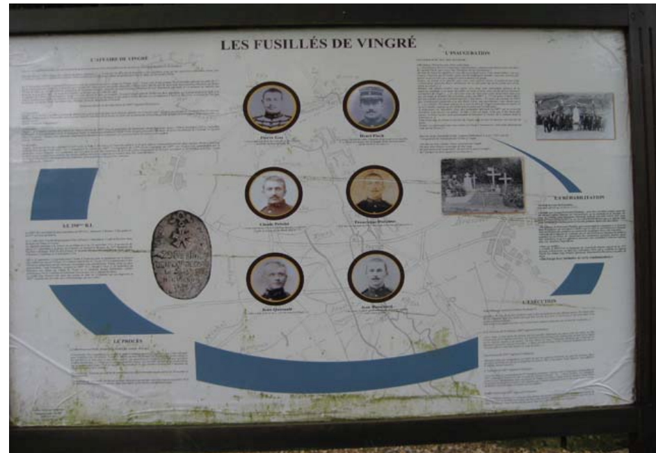
Information Panel re Executed at Vingré

NOTE: For more information and visits to sites west of Soisson see www.soissonnais.net