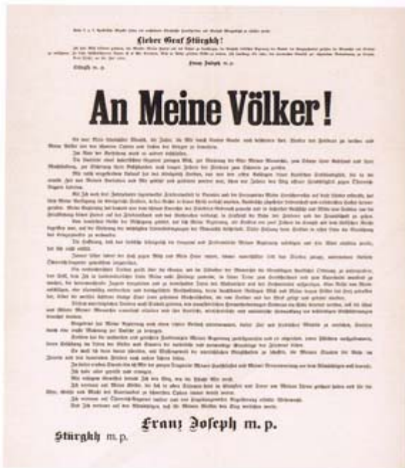
Plakat „An Meine Völker“, Wien 1914 Poster "To My Peoples", Vienna 1914