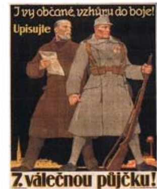
Plakat „I vy obcane, vzhuru do boje! Upisujte 7. Válečnou pujčku! [Mit Herz und Hand fürs Vaterland! 7. Kriegsanleihe]“, Anton Erhardt, Prag 1917, Lithografie Poster "With heart and hand for the fatherland! 7th war bond", Anton Erhardt, Prague 1917, lithograph