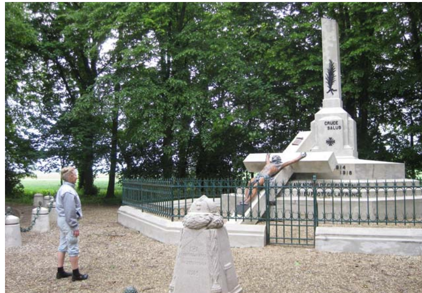
Memorial of the Broken Cross