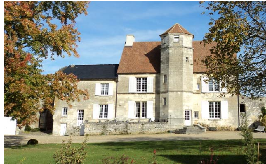
Largny Farm Courtyard: May 2014